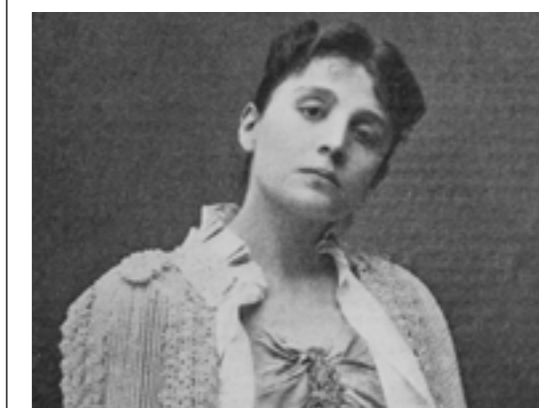
Eleonora Duse (1854 - 1924)