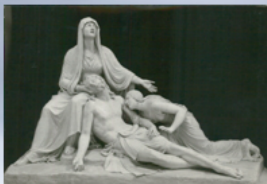
Piety by Antonio Canova